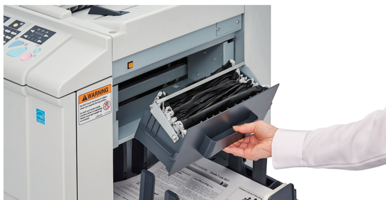
Used Master Box